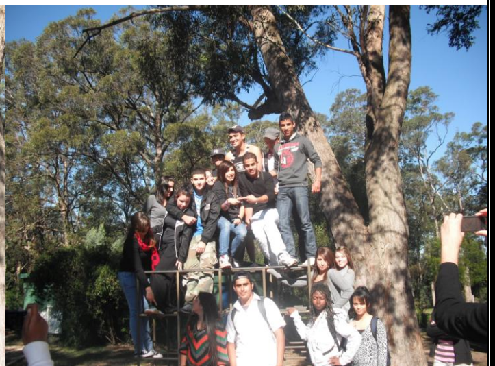
The biologists at rest after a day of hard work