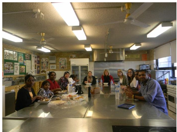
Sharing a meal together