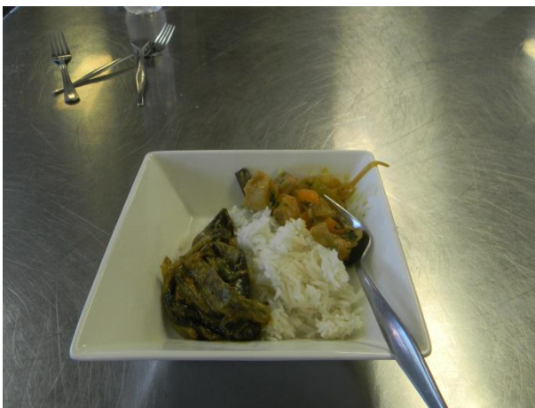
Chicken and Vegetable Curry