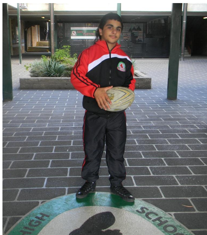
Lurnea High School's new school Tracksuit