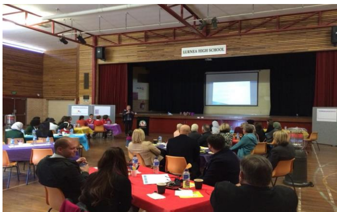
Community Engagement Forum