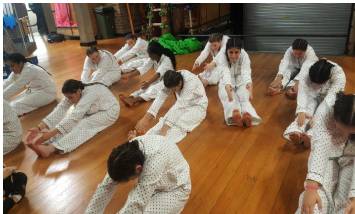
9 Dance Warming Up Backstage at the Ultimo Dance Festival