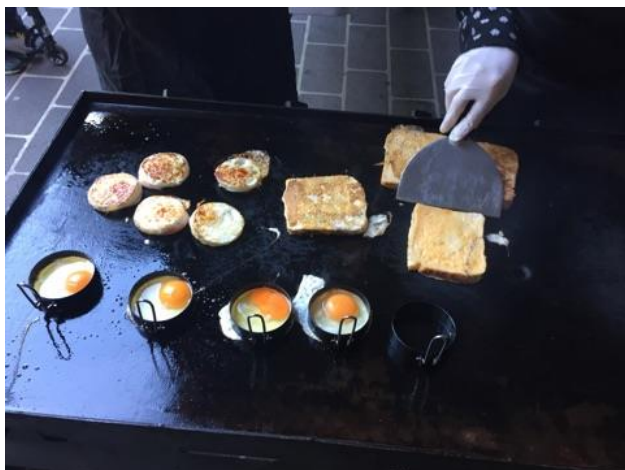
Eggs and French toast BBQ