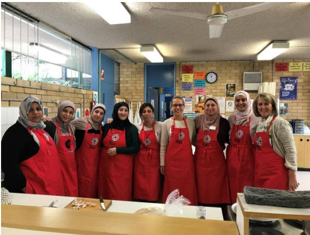
Our lovely ladies enjoying the FoodREDI Program

Next term Miller Tafe is running a Basic Computer Course on Wednesdays from 9.30- 1pm at Lurnea High School. At the end of the course parents will receive a Certificate of Completion. Please ring the school after the holidays if you are interested.