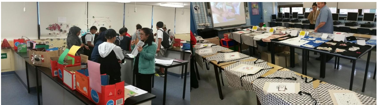
Year 7 and Year 8 Showcase