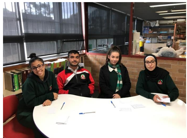
Year 10 Debating Team