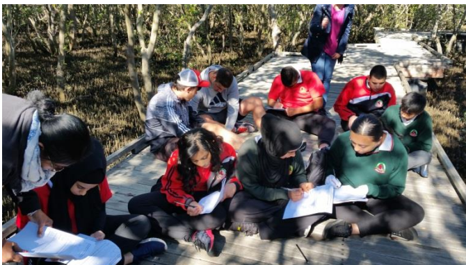
Year 11 Biology Field Trip to Sydney Olympic Park

We look forward to sharing more and more of our students' achievements throughout 2017, as well as keeping you up to date with all of the happenings from within the Science faculty.