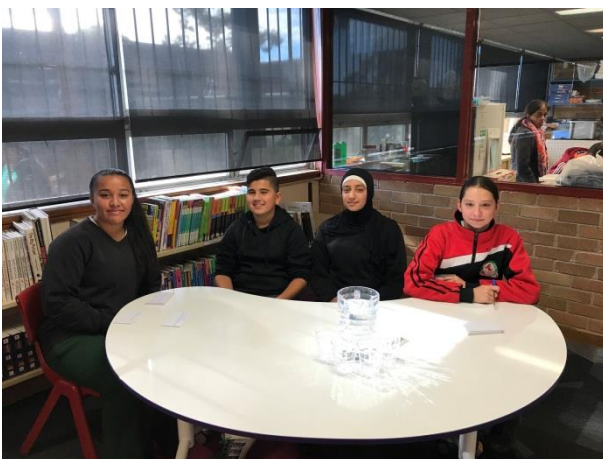
Year 9 Debating Team

We are looking forward to an exciting year in debating