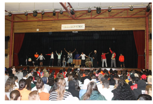
African drummers entertain the Lurnea High School students