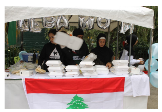
Multicultural Day food stalls, this is the Lebanese Food Stall

Our Multicultural Day was a fantastic celebration of the school's cultural diversity and a very successful day for staff, students and the many families who attended.