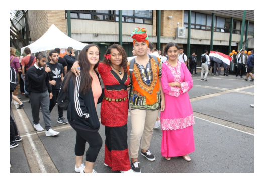
Students dress in their national costumes