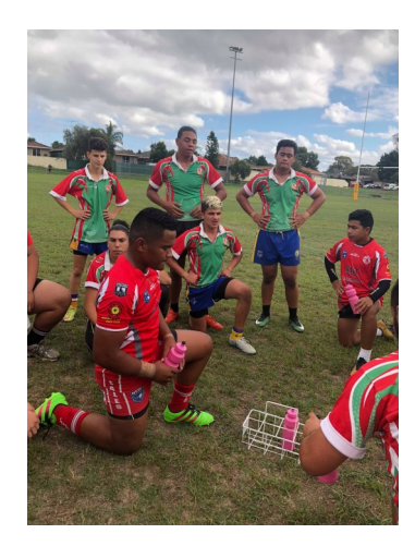
Lurnea High School's football team